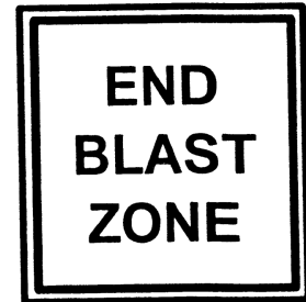
W22-3 42" X 36"