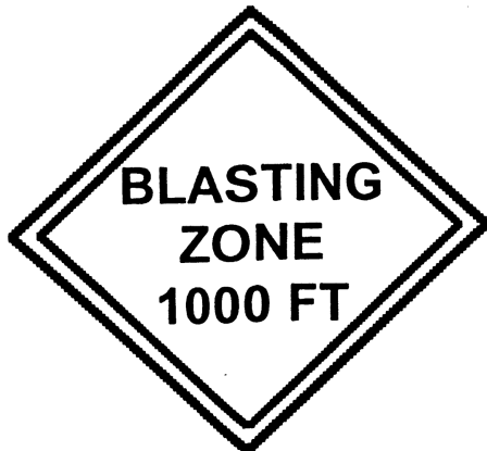
W22-1 48" X 48"